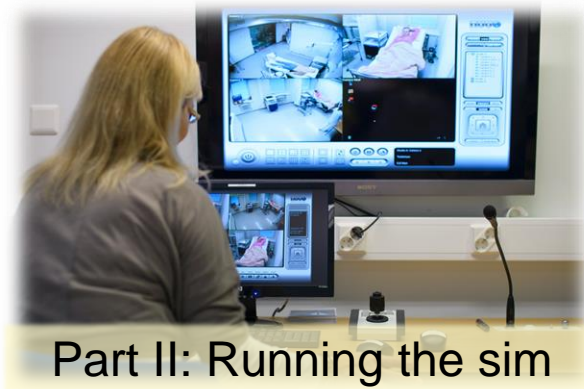
Part II: Running the sim