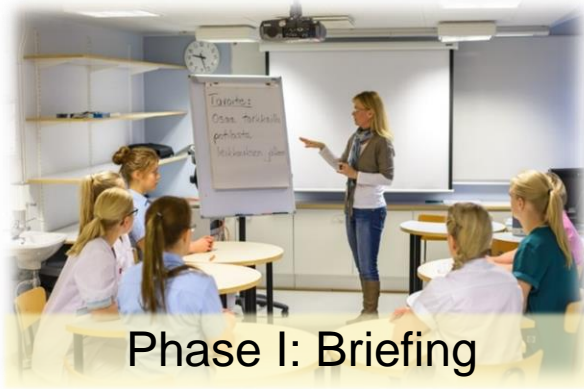
Phase I: Briefing