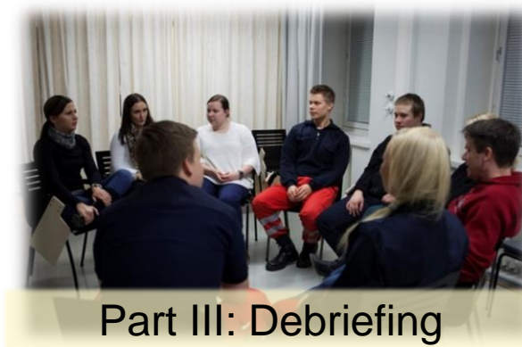
Part III: Debriefing