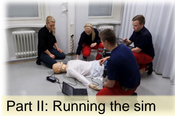
Part II: Running the sim